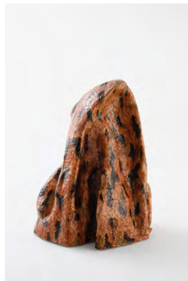
Akane Saijo, The Melting Laborers #4 , 2024