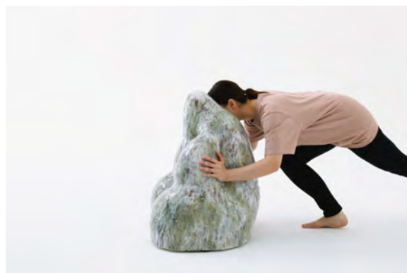
Akane Saijo, The Melting Laborers #3 , 2024