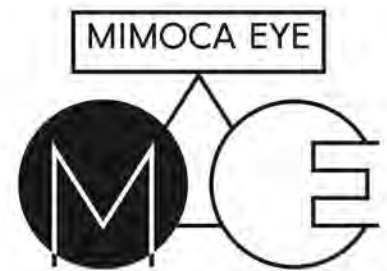
“MIMOCA EYE” Combination Logo

Guided by these words from Genichiro Inokuma, MIMOCA launched the public entry exhibition “MIMOCA EYE” in 2022. It serves as a platform for young artists who will shape the future, offering opportunities for them to explore new modes of expression while reflecting deeply on their time and letting their talents soar to new heights.