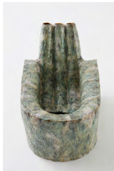
Akane Saijo, The Planets , 2024

A defining feature of Saijo’s practice is her integration of performance with ceramic works. She engages in dialogues with the material while creating ceramics, which after being fired and displayed, are breathed into or carried by performers in actions that give rise to relationships between performer and work or elicit interpersonal interaction. This exhibition includes videos documenting these performances, as well as live performances, creating spaces for spontaneous communication through living bodies, including the audience.