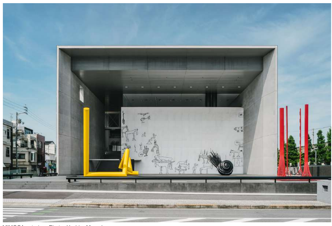
MIMOCA exterior

The Marugame Genichiro-Inokuma Museum of Contemporary Art (MIMOCA) will hold a media briefing on February 12 (Wed), and run a media bus tour on February 13 (Thu), ahead of the "EXPO INOKUMA" exhibition opening on April 12 (Sat) 2025. Members of the media are cordially invited to join us for these events.