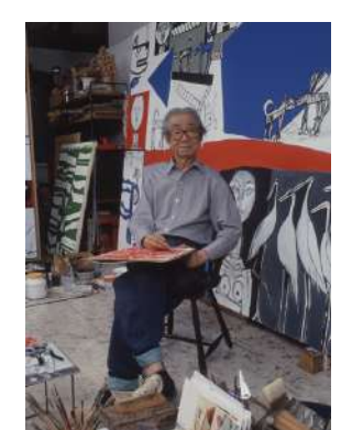
Genichiro Inokuma Photo: Akira Takahashi